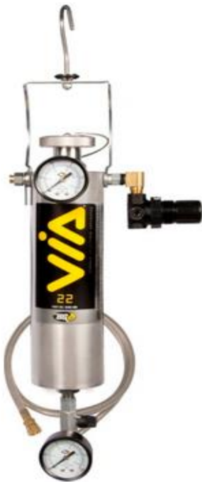
PN 9290-200 22 oz. (650 mL) canister

Today's smaller and lighter automotive engines achieve greater speed than their predecessors while consuming less fuel. The simultaneous reduction of emissions and increased miles per gallon (MPG) figures testify to how truly efficient these engines have become. The downside of the more stringent performance requirements, however, results in a greater susceptibility for a buildup of deposits to occur in air induction and fuel systems, damaging the ratio between air and fuel.